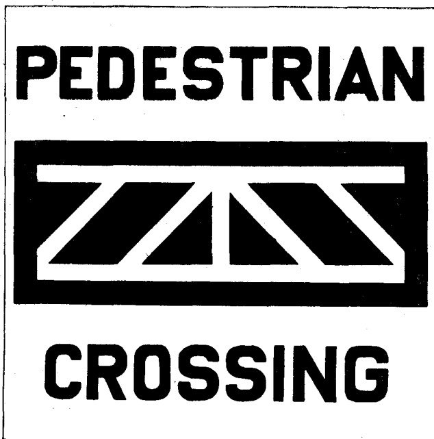
DIAGRAM NO 1